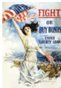
Howard Chandler Christy